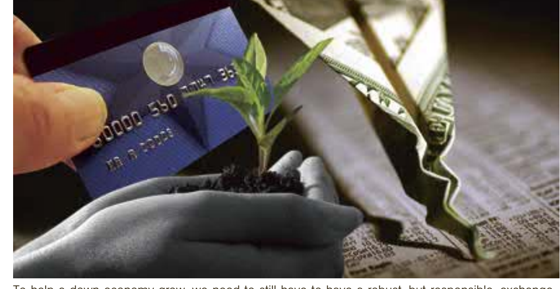
To help a down economy grow, we need to still have to have a robust, but responsible, exchange of goods and services.

But, let's not throw the baby out with the bath water. Financial excess is a problem that we acknowledge and correct, leaving intact the virtues of our core. I, for one, do not C6 | Thursday, January 8, 2009